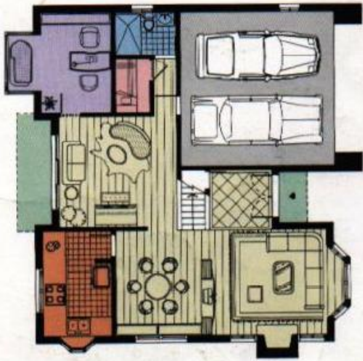
一樓平面圖 1st Floor Plan