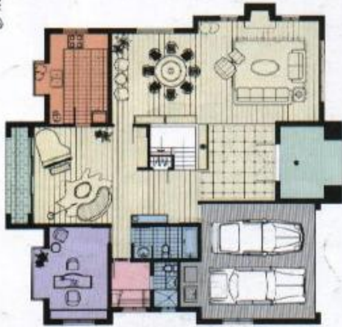
一樓平面圖 1st Floor Plan