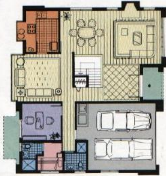
一樓平面圖 1st Floor Plan