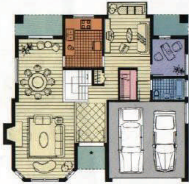
一樓平面圖 1st Floor Plan