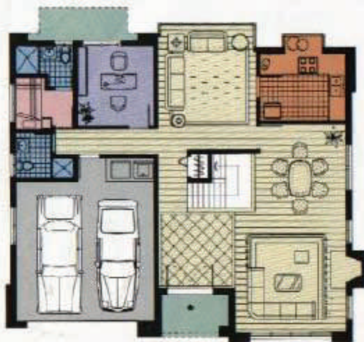
一樓平面圖 1st Floor Plan