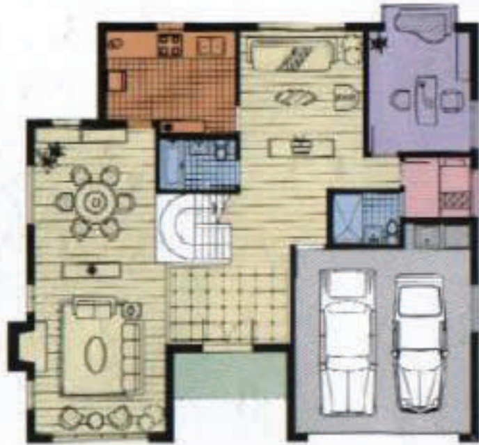
一樓平面圖 1st Floor Plan