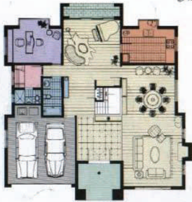
一樓平面圖 1st Floor Plan